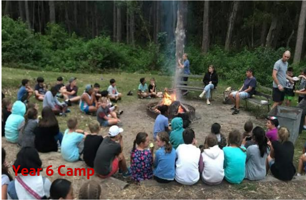
Year 6 Camp