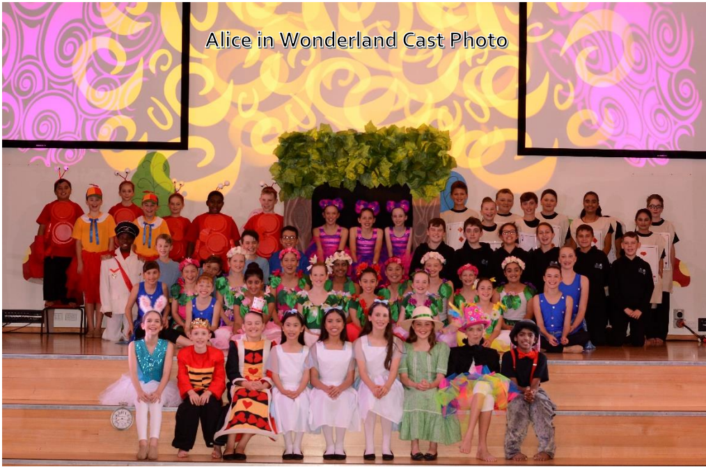
Alice in Wonderland Cast Photo